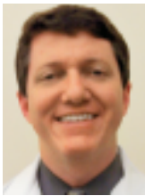
By Todd Nash, DVM

Multiple strategies can help control the clinical signs.